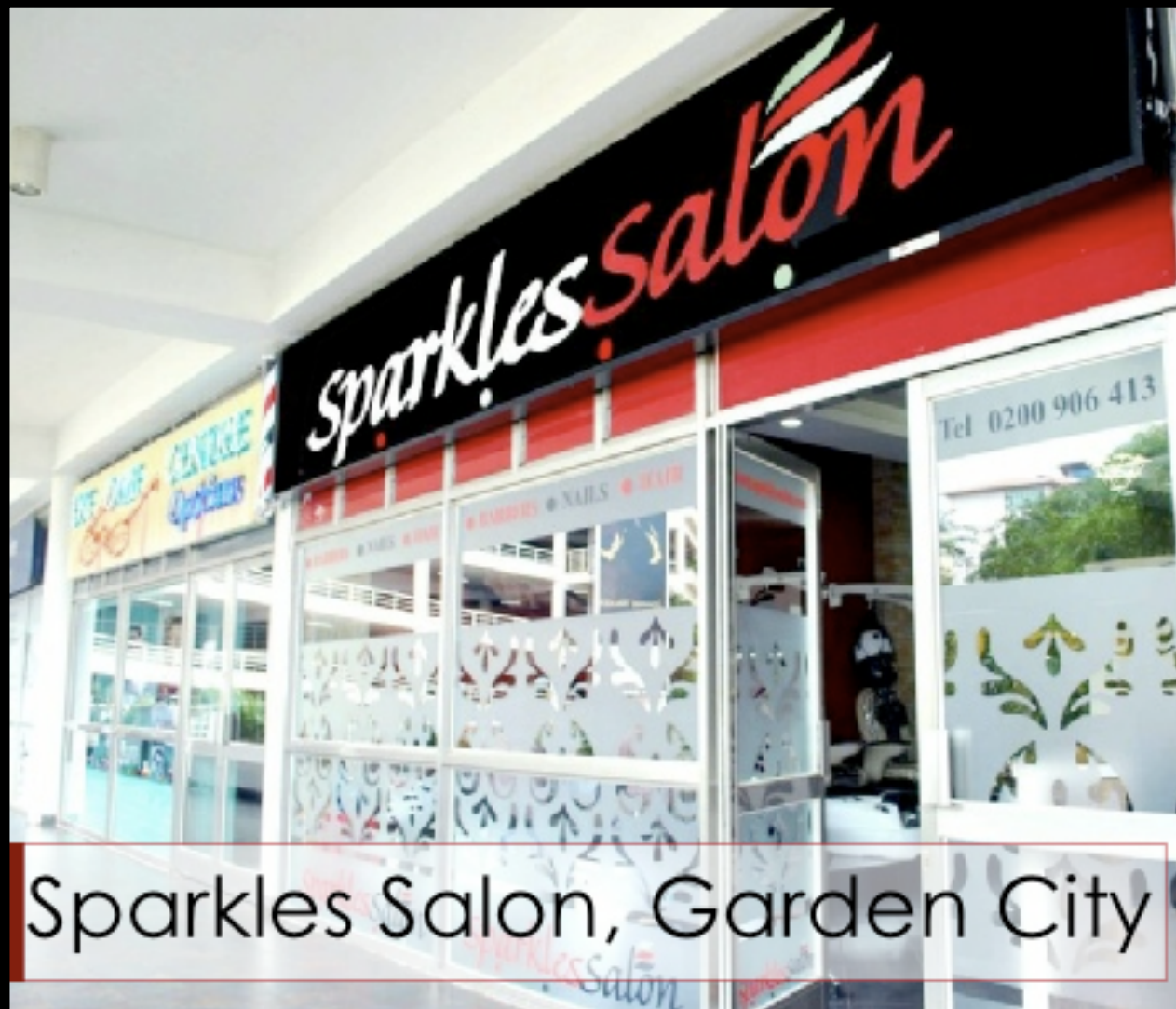
Sparkles Salon, Garden City