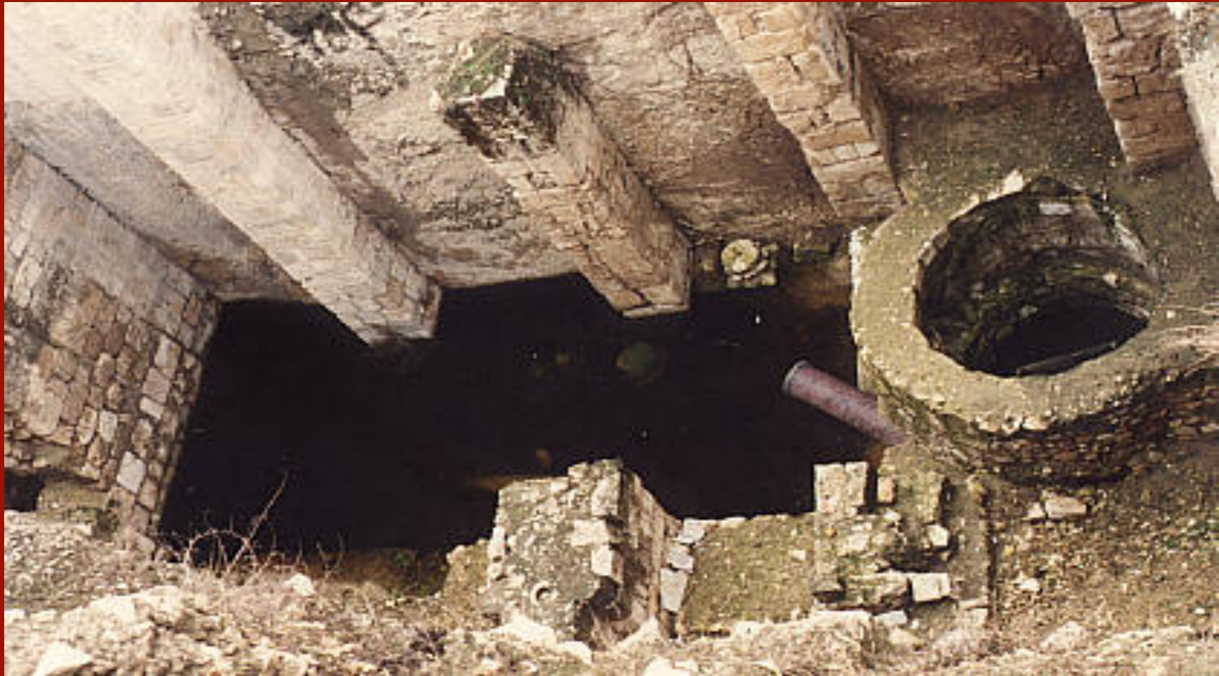
The Pool at Bethesda